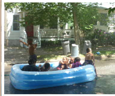
Nearly 40 neighborhood kids enjoy Watermania on July 10 along West 76th Street. This back-to-school event includes water games, dunk tank, water balloons, slip and slide, hot dogs, and refreshments.

The West 65th-70th Block Club changed its name to the Gordon McCart Block Club . The club wanted to reflect the history of the neighborhood in its name: West 65th Street was formerly