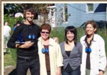
Cleveland Public Art -Blue Bird Project