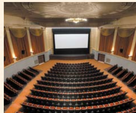
The Capitol Theatre's Main Auditorium before and after restoration