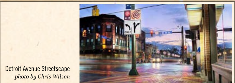
Detroit Avenue Streetscape